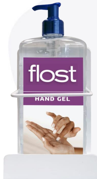
WALL DISPLAY(WHITE METALLIC)